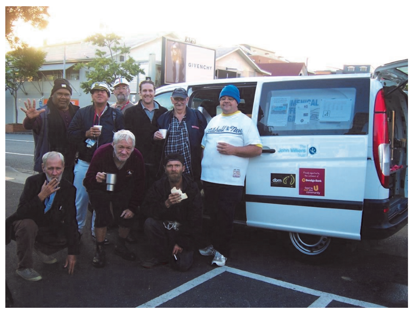
A volunteer and happy friends enjoying a cuppa on the street from the Ecumenical Coffee Brigade van. This is a frontline outreach service which provides a daily round every morning of Brisbane's four city parks providing coffee, sandwiches, fruit and non-intrusive care to the homeless and marginalised in Brisbane's CBD.

Live and Thrive On Country - A targeted project assisting indigenous people build sustainable livelihoods on remote homelands in Queensland $100,000